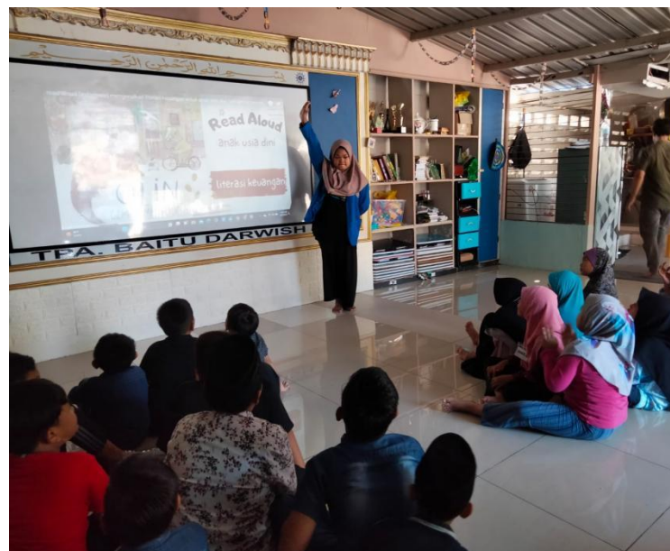
Figure 2. Read and explain the story “Olin Gemar Membaca”