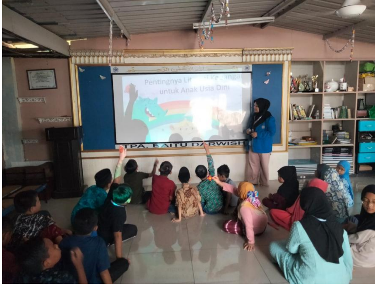
Figure 1. Socialization of the importance of financial literacy in early childhood

literacy in early childhood and socialization of the importance of saving with a decorative money box out of recycled bottles which was carried out as follows: